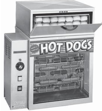
Model: DR-1A Hot Dog Broiler with optional BH-1A Bun Holder